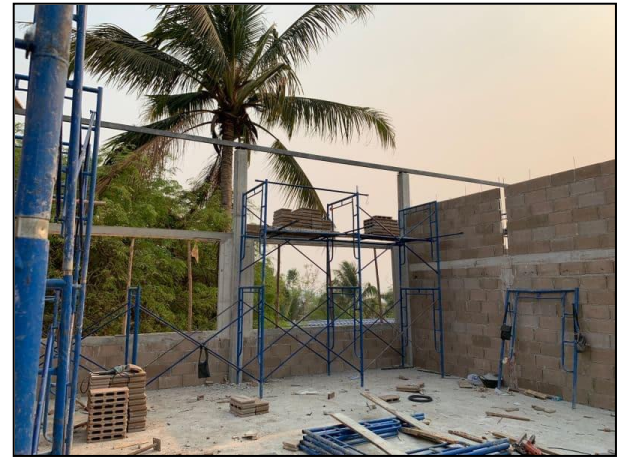
New Lecture Hall